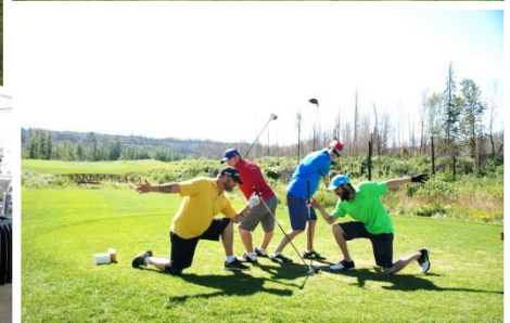
Girls Inc. 24 th Annual Golf Tournament, July 29 th 2017 at the Fort McMurray Golf Club