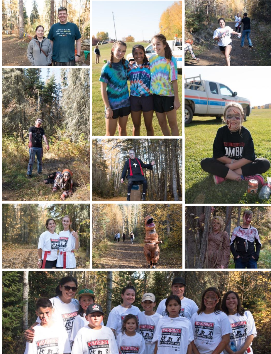
Girls Inc. 6 th Annual Zombie Run in Support of United Way Fort McMurray, September 30 th , 2017.

One of the most fun-filled community events for Girls Inc. is the Zombie Run which is held either late September or early October as a United Way fundraiser. The response from the community is overwhelming as runners, zombies, and make-up artists volunteer for the day. This scary run brings out over 50 people to help raise money for the United Way Campaign and gives the runners the chance to survive the zombie apocalypse.