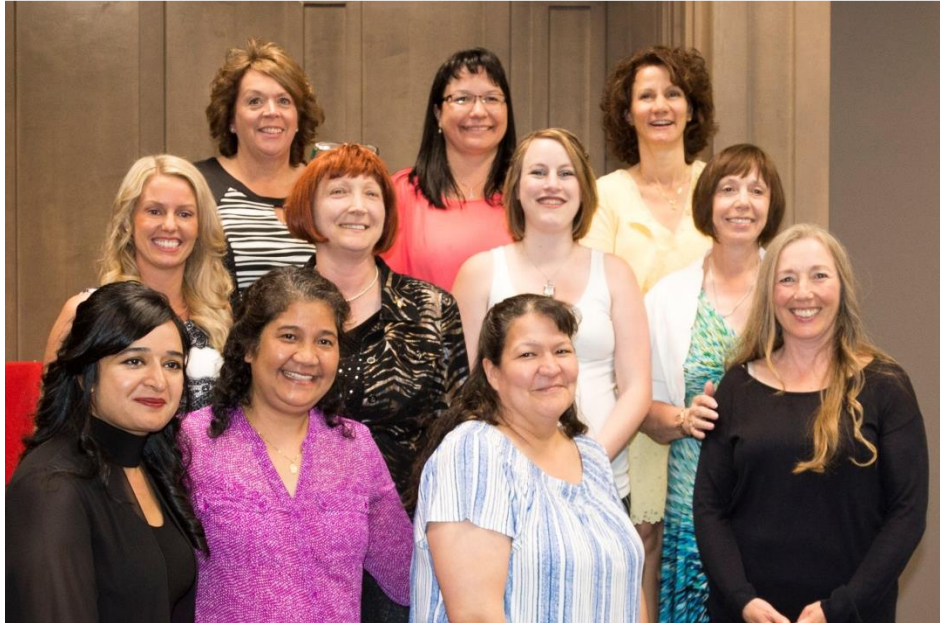
Girls Inc. 5 th Annual Women of Inspiration Celebration Presented by Syncrude Canada Held on June 10 th , 2017 at the Unifor Union Hall