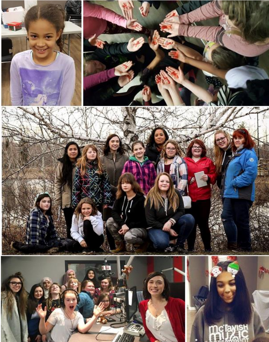
Students and Mentors 2017 Girls Inc. Programs